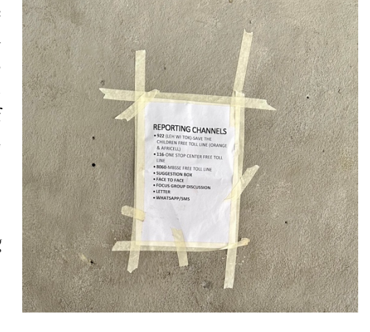
Figure 5. Information sheet in Njaghema on reporting channels for sexual abuse cases.

SC has found that telephone hotlines are the most accessible accountability mechanism for adults and children when reporting abuse, including SGBV. The SC Sierra Leone runs one of the toll-free hotlines (Leh We Tok, 922). Another is run by the One Stop Centre (116) under the Ministry of Gender and Children. The third one is run by the MOBSSE (8060).