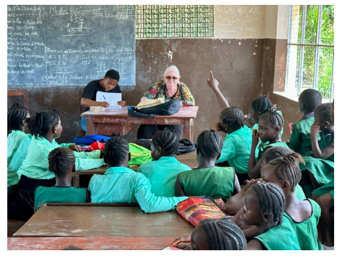
Figure 7. Interview with members of the CC in Kassay.

In case of severe violations of children's rights, not least sexual violence, children were aware that they could phone #922, #116 or #8060. The most often mentioned was #922, i.e., the SC Sierra Leone number. "Now we phone #922 to report violations; we loan a phone when somebody violates us," said a child. There were several ways of reporting. Another child explained: "When a child is violated, it should be reported to the headteacher and the village chief, who then takes legal action and warns the perpetrator." Still, another child informed that in case of serious violence, a child should report first to MSGs: "They report it further and call the 922. MSG helps us a lot."