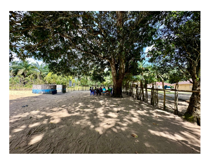
Figure 8. Interview with members of the MSG in Messima.