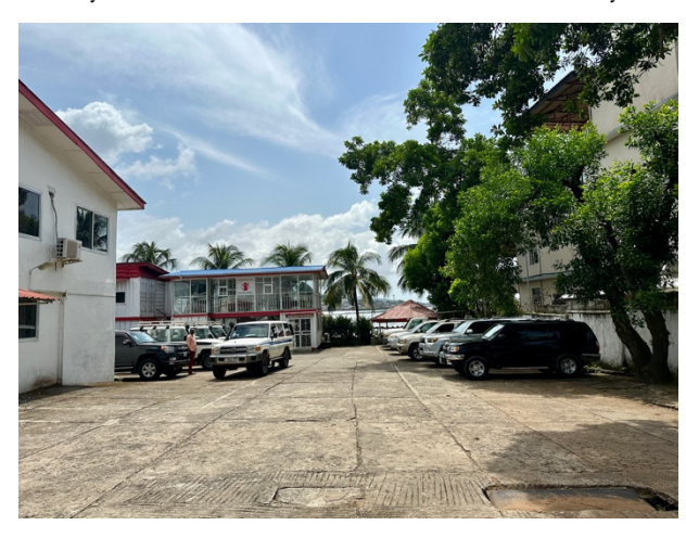
Figure 1. SC Sierra Leone Country Office, Freetown.

The organisation's staff works directly with children and families, engages with communities, and builds the government's capacity at local and national levels to enable children, with a specific focus on girls, to realise their rights to health, education, protection and participation. For more upstream impact, the organisation's advocacy team works to influence legislation, policies, and funding for children's and gender issues through direct engagement with government agencies and working in partnership with civil society, including girl champions. In addition to strong community engagement, SC Sierra Leone has an extensive working relationship with the Government of Sierra Leone, including the Ministry of Social Welfare, the Ministry of Health and Sanitation and the Ministry of Education.