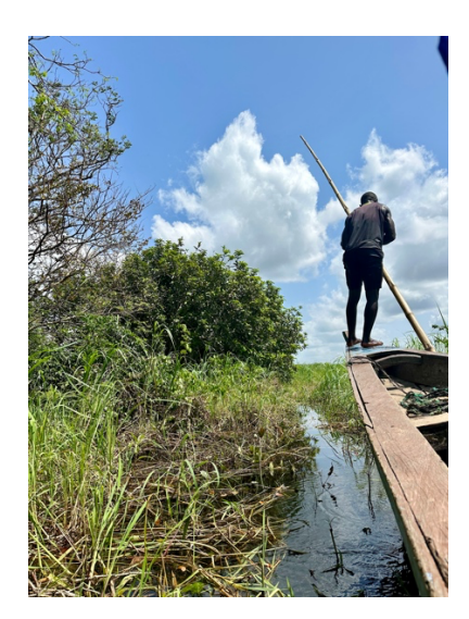
Figure 2. Crossing ricefield to reach Kombpi.