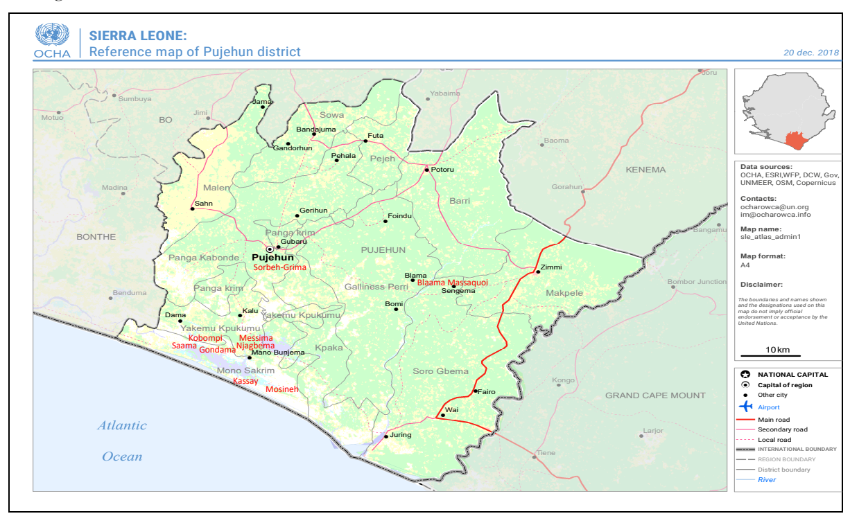
Figure 3. Map of Pujehun District with the approximate location of the target school communities, nine marked in red and one in black (Pujehun town).

Pujehun District is in the Southern Province and is the third largest in the country, with a surface area of 4,105 km²; since 2017, it has been divided into 14 distinct Chiefdoms. It borders the Atlantic Ocean in the south-west, the Republic of Liberia to the south-east, Kenema District to the north-east, the Bo District to the north and Bonthe District to the west (Figure 1). It is characterised by rivers, e.g., the Moa River, and streams, which provide irrigation for farming and support local livelihoods. Agriculture forms the backbone of the district's economic activity through its fertile land that allows for cultivating various crops such as rice, cassava, cocoa, coffee, and palm oil; fishing is an important source of supplementary food and income for many communities along the riverbanks. Further, diamond mining, with the involvement of internationally owned mining corporations, is an important economic activity. Diamonds are generally found in riverbeds, muddy deposits, or within the earth's surface, with a potential for small-scale artisanal mining activities in certain areas within the district.